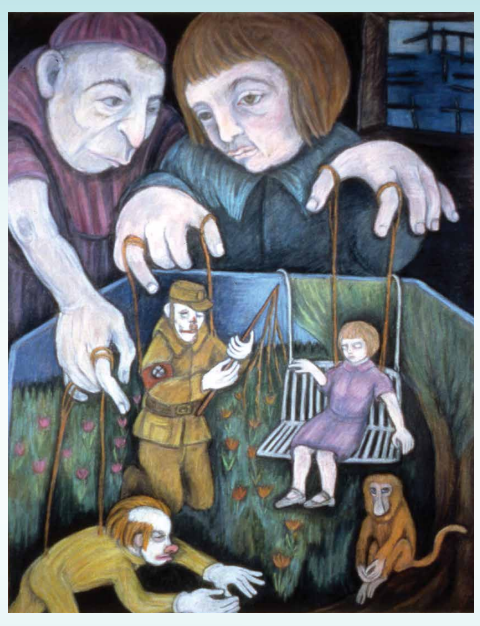
Dream Play, 24" x 18" by Lilli Gettinger from the Dream Voyage series (1971-75)

The art of Lilli Gettinger (1920-1999) addresses the experience of personal and collective trauma. The discovery and release of imagery, memory, and feeling inherent in Gettinger's rigorous artistic practice parallels the psychoanalytic process of cure. Symposium panelists will explore the intimate connection between the creative and therapeutic processes.